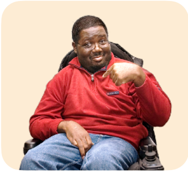
Photo ID is an official document which has a recent photo of yourself on it.